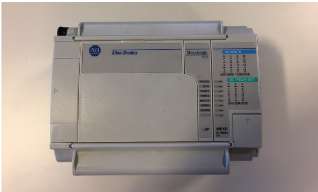
Fig 3 - Allen Bradley PLC are obsoleted, but can still be supported by our spare part sales