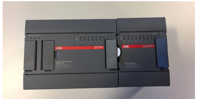
Fig 2 – Old ABB AC1131