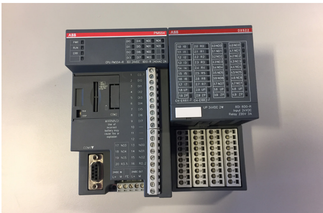
Fig 5 – New ABB PLC