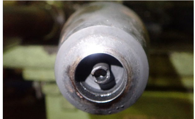
Fig. 2 Close-up of the damaged nozzle

As the service reports show, this design is far from being sufficiently robust and the complete tip of the nozzle may disintegrate from the fuel valve, see Fig. 2.